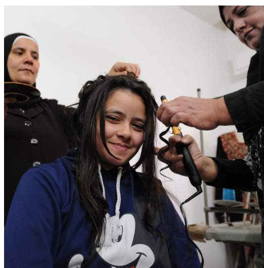
Syrian refugee women attend vocational training in hairstyling at a CARE Urban Refugee Center in Hashimi in East Amman.

Many Syrian men have been killed or disappeared, and families have been separated. Many more men have sustained serious injury – both physical and psychological – or are otherwise unable to provide for their families. The result has been a difficult, but profound and potentially transformative change for women, many of whom have been faced with situations in which they need to be the primary breadwinner for their family. A 2019 study found that 31% of women in Syria reported having taken on new roles and responsibilities since the conflict began, and these new responsibilities come with some degree of autonomy. 16 The same study found that if women contribute to the family's income, the likelihood of being able to be part of family decision-making processes roughly doubles. 17