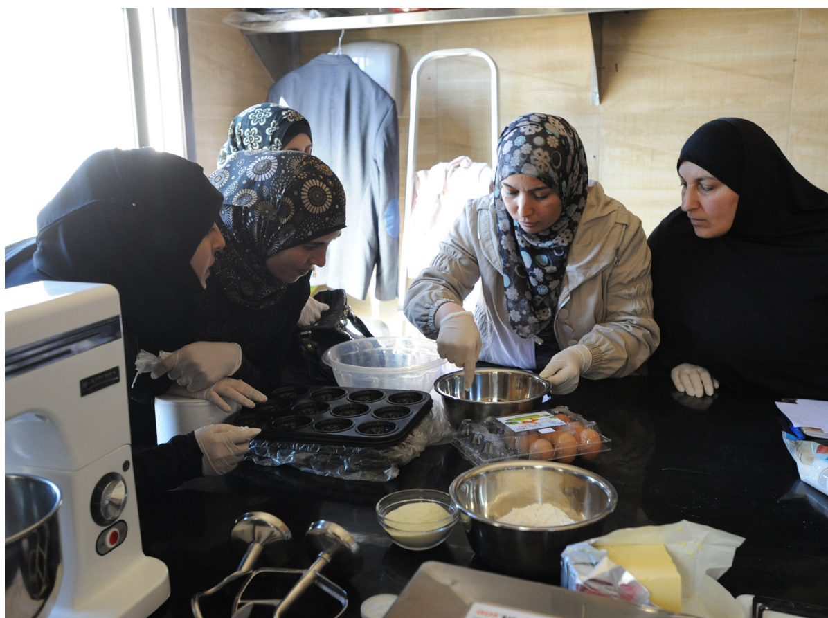
Syrian, Lebanese, and Palestinian women learn together during a pastry-making course at a CARE-supported vocational training center in Tripoli, Lebanon.

“These new circumstances have put me in the position of being both mother and father for my children, and this applies to most women in my community... The current situation supports women’s empowerment and the idea that she is equal to men, but the reality is that she took on the role of both males and “I used to be a housewife in the past, a mother and a lady in my community, but afterward, I became like females simultaneously. Now she does both” (Woman, 35, Raqqa, Displaced). 24